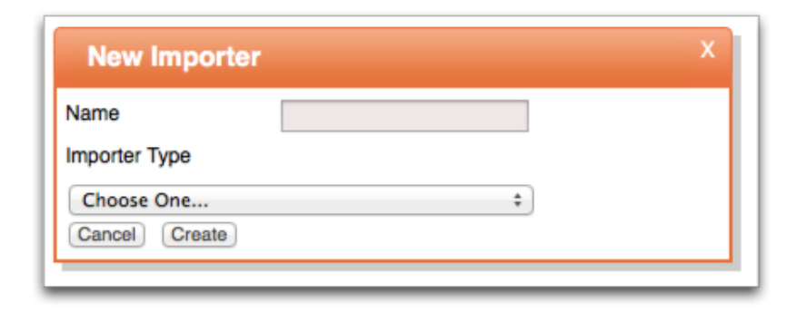
Figure 2: New Importer window